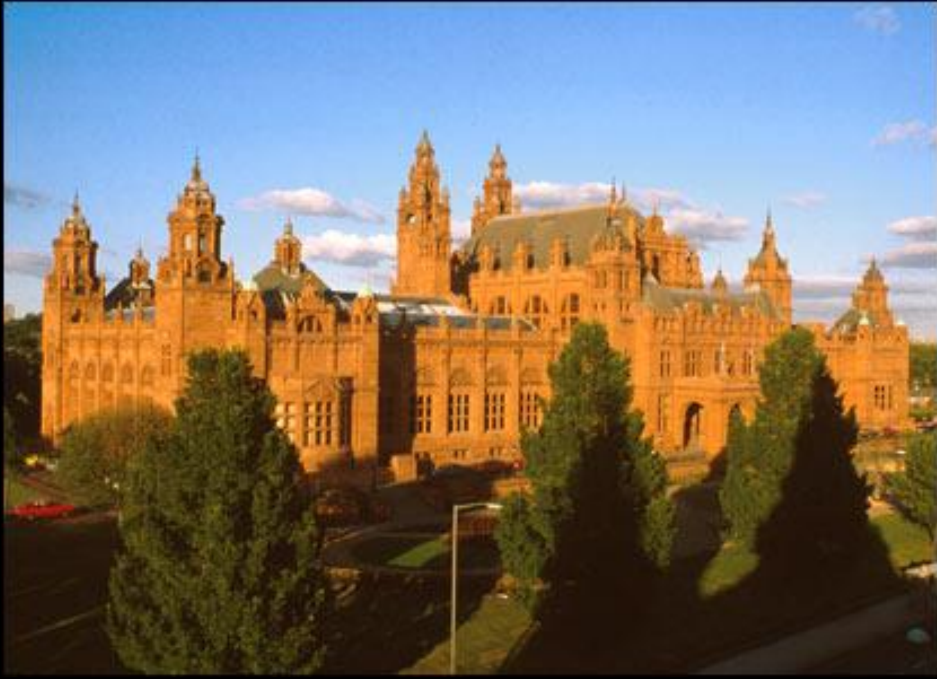
MRC/CSO Social and Public Health Sciences Unit, University of Glasgow.