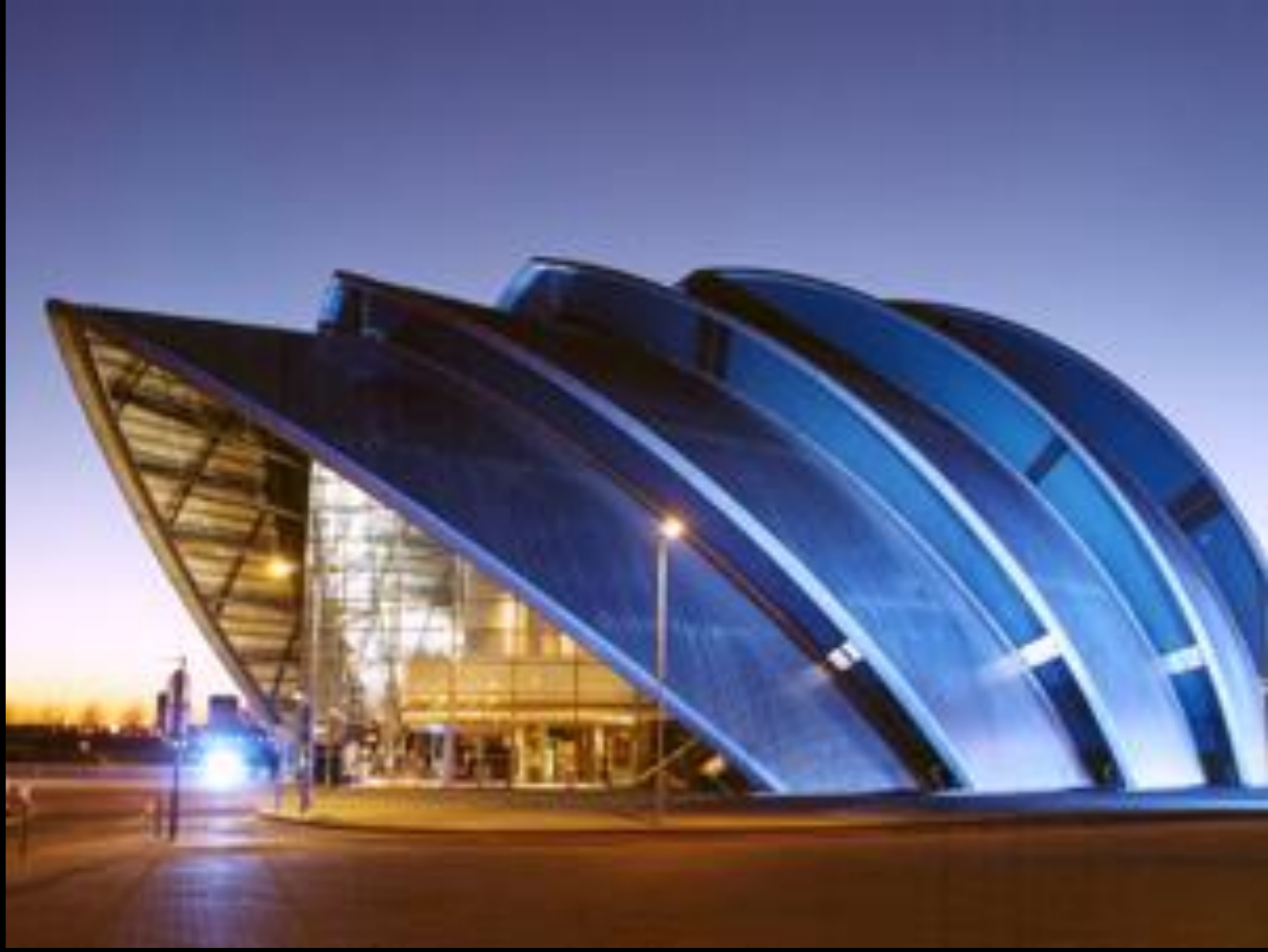
MRC/CSO Social and Public Health Sciences Unit, University of Glasgow.